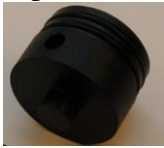
Full membrane end cap